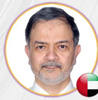
Dr. Imran Khan